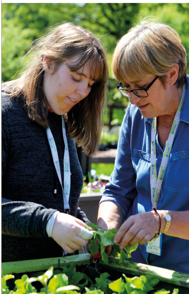
Student from Royal School Manchester learning about horticulture