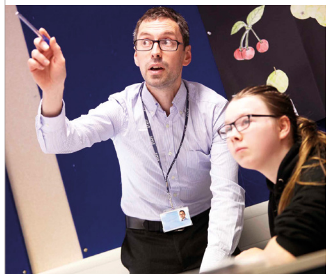
An employability lesson at Derwentside College

In summary, as a college we have found that the combination of extra time spent with learners with SEND, investing in staff with extensive SEND experience and adapting and creating careers resources specifically for learners with SEND has helped us to meet the needs of all of our learners in the college as they progress into the world of work.