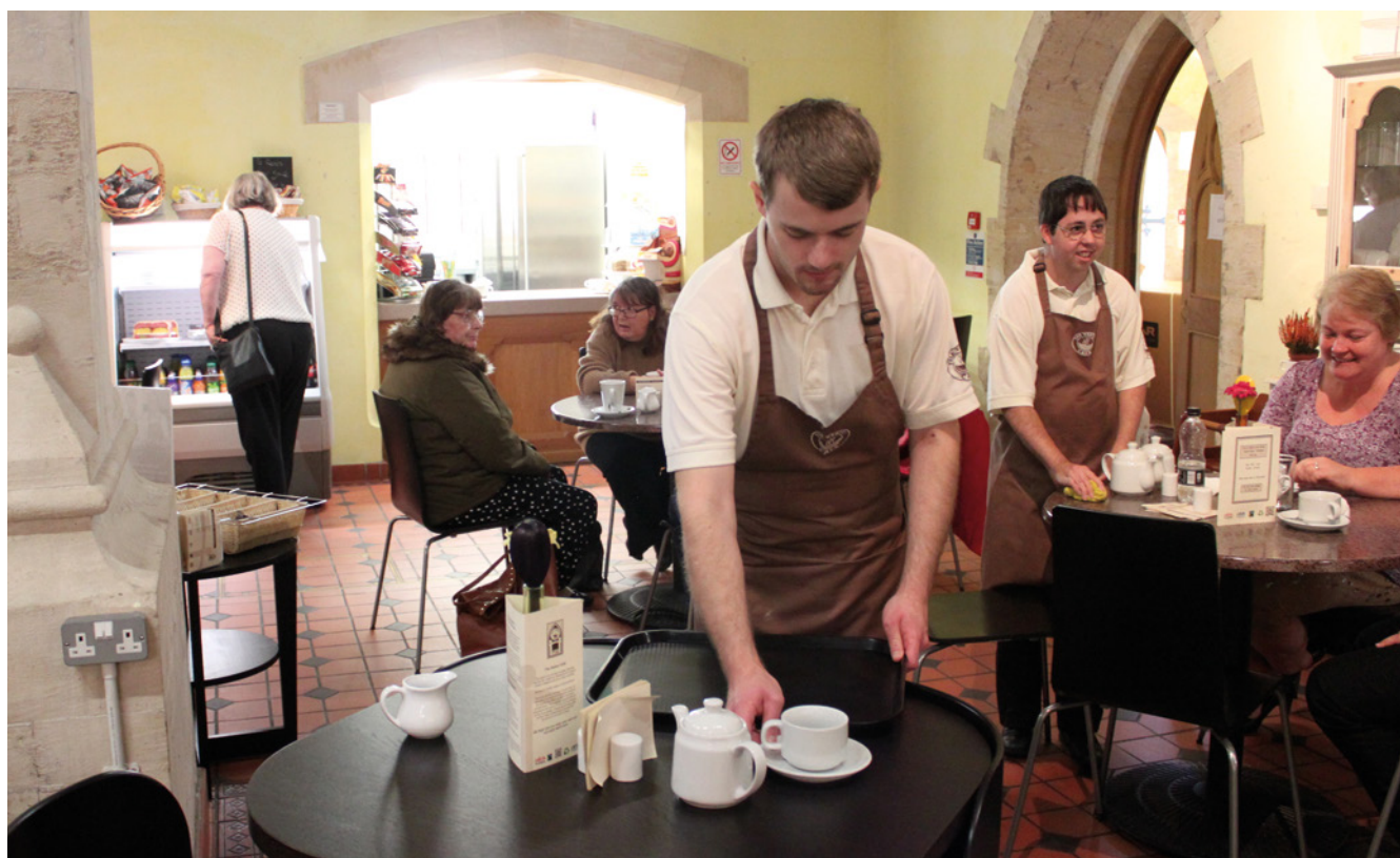
Students from Catcote Academy working at The Vestry café

Within the Steps programme, we are working in partnership with the Joseph Rowntree Foundation and Hartfields Retirement Village, based in Hartlepool, to develop our students' soft skills and help them gain further knowledge of the labour market. Students attend Hartfields one day a week to access three different work areas per academic year. Departments involved include maintenance, domestic support, horticulture, retail, catering and administration.