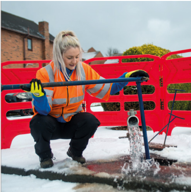
Northumbrian Water employee at work

schools need from an employer, what works and what doesn't. I also wanted to learn how to achieve better long-term outcomes when we welcome those with different needs into our workplace.