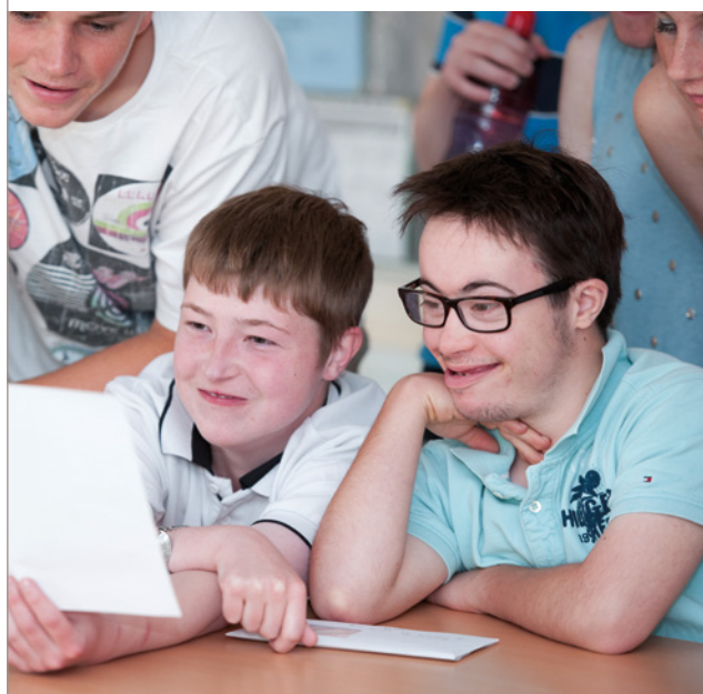
Students from Brookfields School engaged in classroom-based career coaching sessions

You can encourage all stakeholders, including non-experts, to contribute to the early career development of young people with SEND. Through the framework of the Gatsby Benchmarks, you can work together with each young person and their parents and carers to set objectives, minimise barriers and support them effectively towards a positive career outcome.