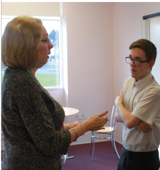
A careers lesson at Catcote Academy

In addition, we offer a range of in-house opportunities to boost our students’ confidence in the workplace and to develop their employability skills within the following areas: reception duties, horticulture, grounds maintenance, ICT, admin, hair and beauty, enterprise, reprographics, hospitality and catering and classroom support.