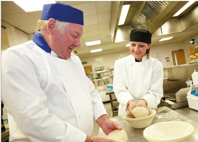
A catering course at Derwentside College