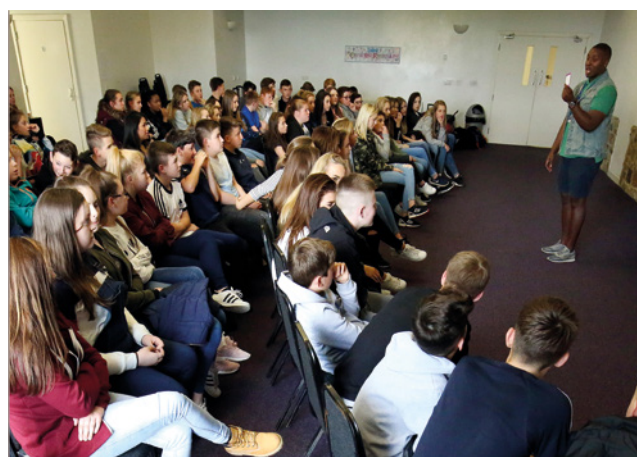
External speaker working with students from St Joseph's Catholic Academy

In our sixth form we have a student whose goal has always been to go to university. Due to her physical disability she uses a wheelchair, and is unable to write or carry out many tasks other students take for granted. She had always attended specialist provision but during her GCSE years she was proactive in getting in touch with local schools that could offer A-levels. However, although she had no learning difficulties, there was a clear gap in provision in our local area for students with these types of physical disability. I felt that we could meet the needs of this student,